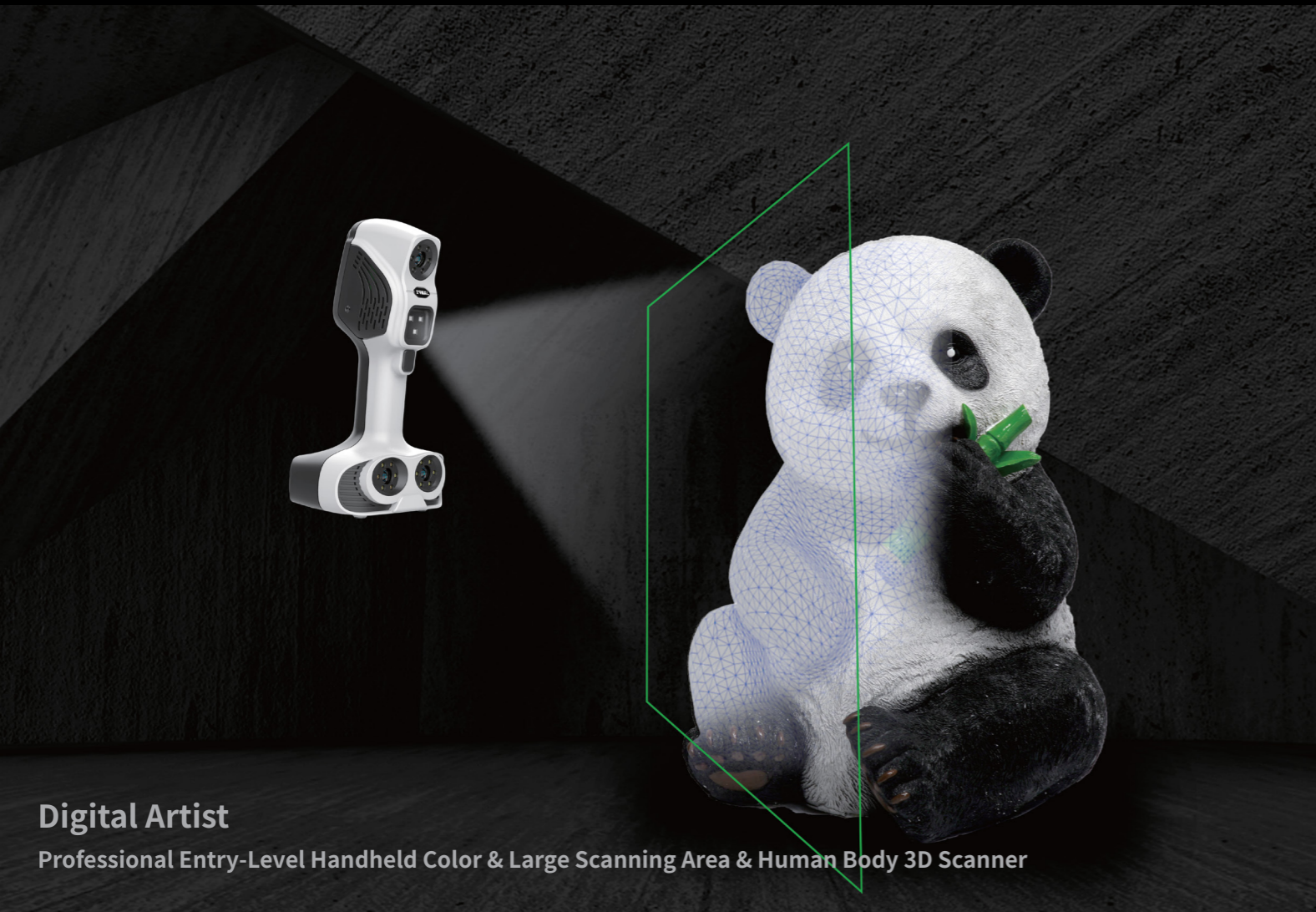
Digital Artist Professional Entry-Level Handheld Color & Large Scanning Area & Human Body 3D Scanner

iReal 2E adopts the Infrared VCSEL structured light technology to bring you the safest and most comfortable 3D scanning experience. Without attaching markers, a quick texture capturing and geometry acquisition can be achieved. Mixed alignment modes meet various scanning situations.